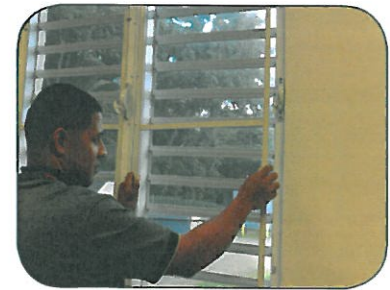
Install or repair window & door screens.

For more information, visit: www.cdc.gov/dengue , www.cdc.gov/chikungunya , www.cdc.gov/zika