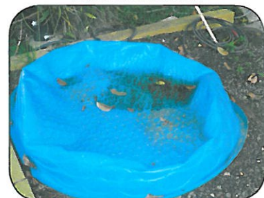
Drain water from pools when not in use.