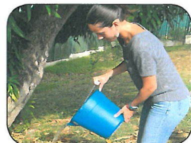
Drain & dump any standing water.