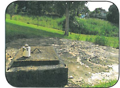
Keep septic tanks sealed.