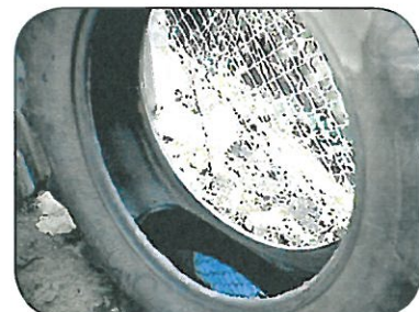
Recycle used tires or keep them protected from rain.