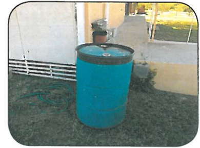
Keep rain barrels covered tightly.