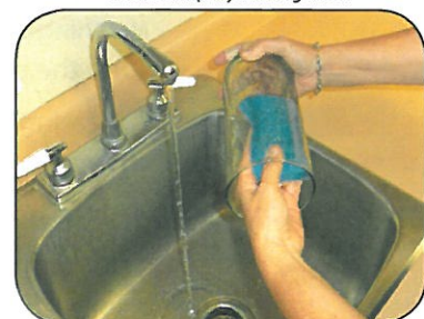
Weekly, scrub vases & containers to remove mosquito eggs.