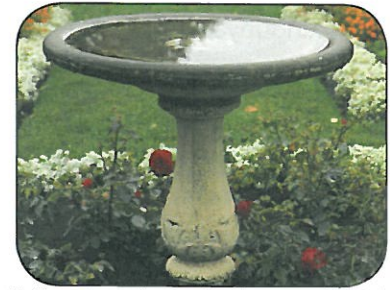
Weekly, empty standing water from fountains and bird baths.